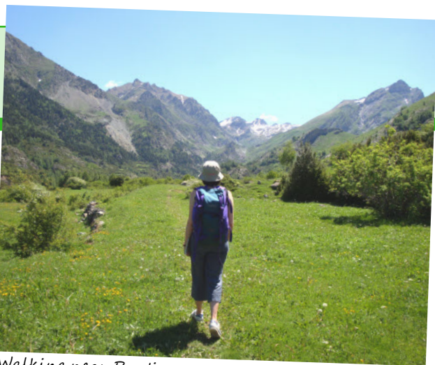
Walking near Panticosa

Expect spectacular views of high peaks, clear blue mountain streams, and the valleys to ourselves as we enjoy some of the region's highlights. Don't forget your camera!