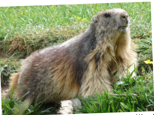
Marmot - great picture Kim!

This is a week of relaxed walks with the emphasis on finding quiet beautiful spots with breathtaking scenery, rather than scaling high peaks. Therefore the walks will not be overly strenuous and suitable for anyone with a reasonable level of fitness.